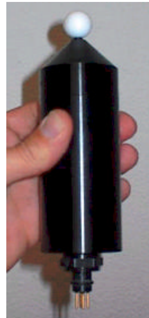
The new QSP-2000 is rugged and compact.

QSP-2300 and QSP-2350 , logarithmic-output versions are also available. This sensor type is designed specifically for integration with CTD systems and dataloggers requiring a limited-range of signal input.