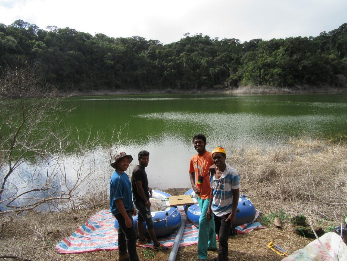
Lac Maharasika (1000 m d'altitude) Profondeur 7 m Carotte sédimentaire 5 m